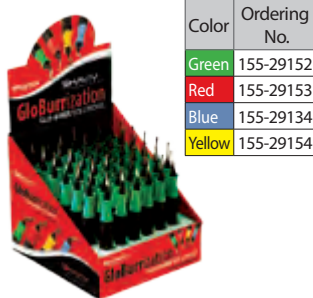
Above counter display box supplied with purchase of 48 pcs.

B10 can be supplied in the following colors: