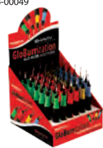
Contains blades E100, E200, E300, E111 (12 pcs. each)