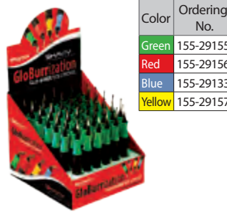
Above counter display box supplied with purchase of 48 pcs.

E100 can be supplied in the following colors: